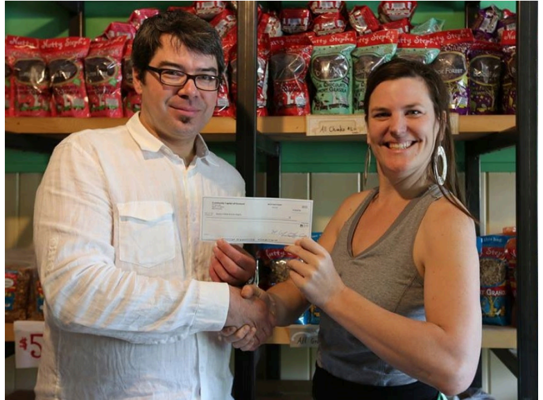
COMMUNITY CAPITAL OF VERMONT