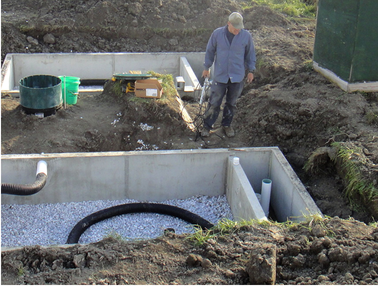
INSTALLING WATER QUALITY TECHNOLOGY.

Apply knowledge of engineering technology and biological science to agricultural problems concerned with power and machinery, electrification, structures, soil and water conservation, and processing of agricultural products.