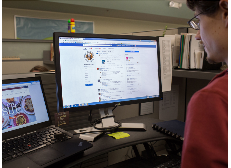
SOCIAL MEDIA MARKETING AT KING ARTHUR FLOUR