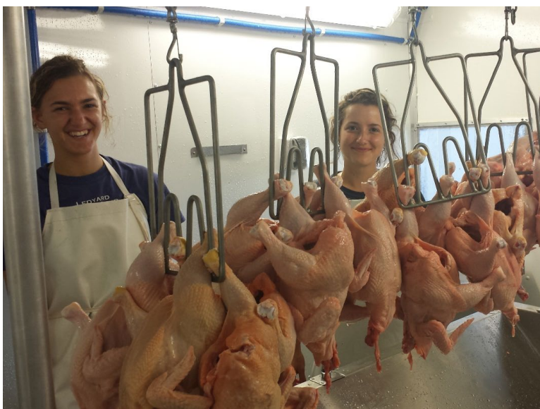
STUDENTS AT HANNAFORD CAREER CENTER