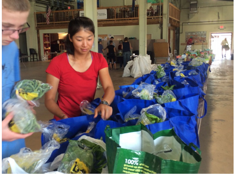
PACKING HEALTH CARE SHARES.