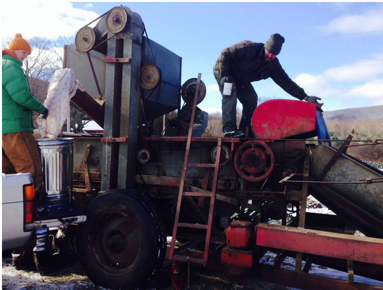
FARM MACHINERY IN USE AT YODER FARM

Diagnose, adjust, repair, or overhaul farm machinery and vehicles, such as tractors, harvesters, dairy equipment, and irrigation systems.