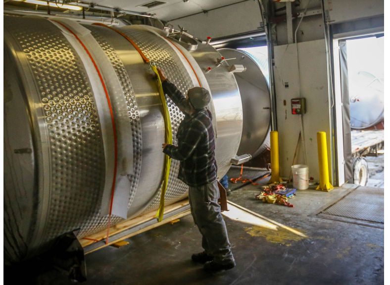
HARD CIDER MANUFACTURING

Qualities that employers look for when hiring in this field include analytical skills, critical thinking, problem solving skills, interpersonal skills, and speaking skills . Technical assistance workers must analyze client portfolios and are constantly working with numbers. Professionals in this career interact with clients often and must be able to make clients feel comfortable and be able to respond to questions and concerns.