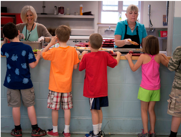
MONKTON CAFETERIA LINE.

Food service managers or other food service workers in a school or healthcare setting.