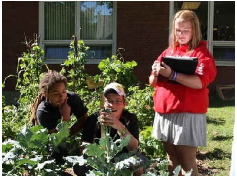
NORTHFIELD HS STUDENTS GARDENING

Educators work in many different contexts, throughout all grade levels and even outside the formal school setting. Grade school teachers work full-time and often spend time outside of school hours grading papers and preparing lessons. Grade school teachers work the 10-month school year and have a 2-month break during summer, during which they may teach summer programs. Postsecondary teachers work both full-time and part-time. Part-time postsecondary teachers often have a full-time job in their field of expertise in addition to their teaching position. Postsecondary teachers can have flexible schedules, but are generally on campus during normal working hours to teach classes and hold office hours. Some postsecondary teachers teach summer courses or conduct research during the summer.