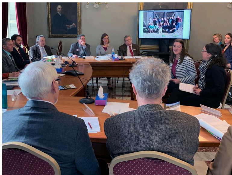
TESTIFYING TO THE VT STATE LEGISLATURE AG COMMITTEES

Employees or consultants who engage in advocacy or support community activism related to food and agriculture issues, for example employees of an anti-hunger nonprofit.